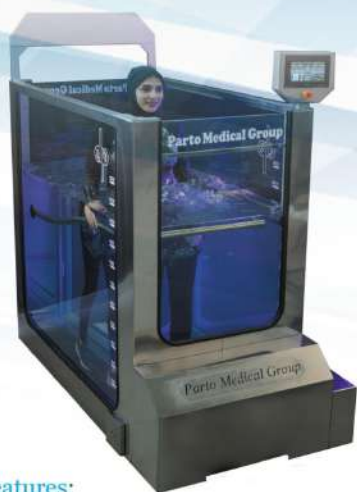
WATER TREADMILL HYDRO WORK 100F