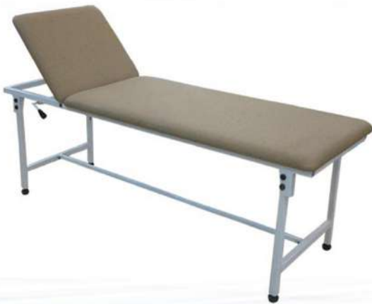
WITH FOLDING BREAKER