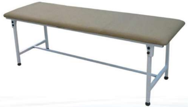
WITHOUT FOLDING BREAKER