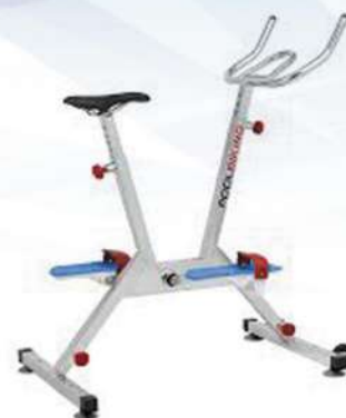
WATER BIKE HYDRO BYC01